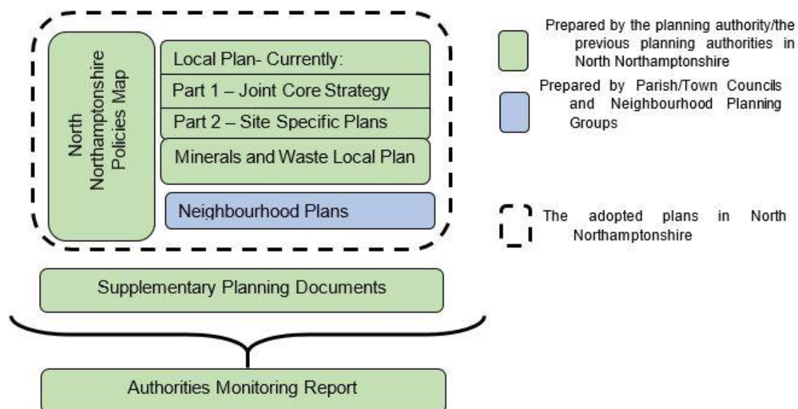
Figure 1: Plan Making in North Northamptonshire

2.3 North Northamptonshire's local plan documents are also supported by a number of Supplementary Planning Documents (SPDs) that provide detailed guidance on various planning matters which explain and amplify the policies in them. Consultation on these documents is governed by separate regulations, but will be undertaken consistent with the methods set out in this SCI.